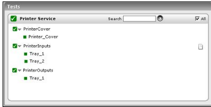
Figure 3.2: Tests that run on the Printer Service layer