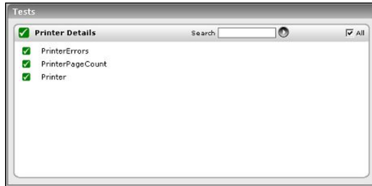
Figure 3.3: Tests executing on the Printer Details layer