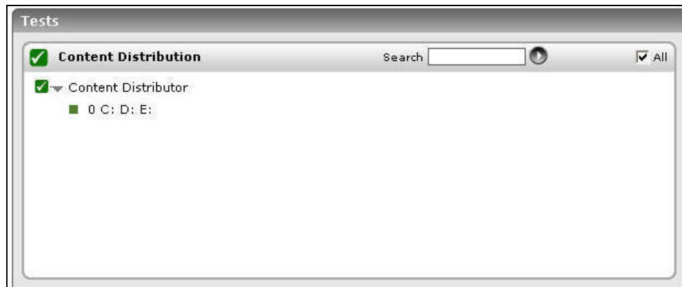
Figure 3.3: The tests mapped to the Content Distribution layer