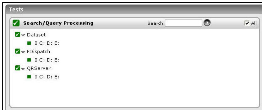
Figure 3.7: The tests mapped to the Search/Query Processing layer

To assess the query processing ability of the Microsoft FAST Search server and capture related anomalies, use the tests mapped to this layer.