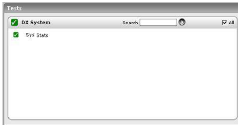
Figure 3.4: The tests associated with the DX System layer