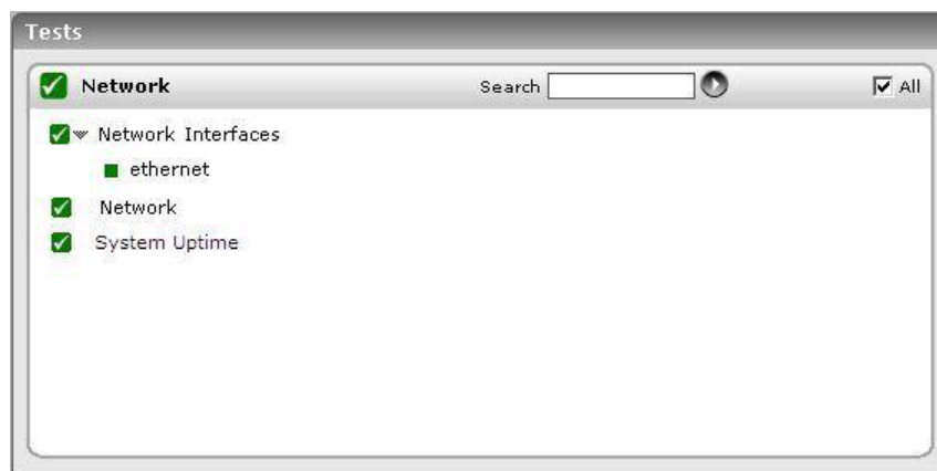
Figure 3.3: The tests associated with the Network layer

The Network layer measures the network connectivity to and from the Juniper DX device, the availability of its network interfaces, and the uptime of the device (see Figure 3.3).