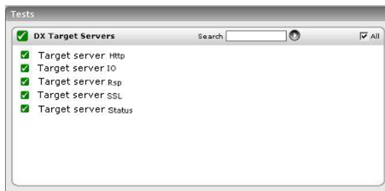
Figure 3.6: The tests associated with the DX Target Servers layer

This layer monitors the performance of the target web servers in a Web cluster, and reports a wide range of performance data pertaining to each of the servers. Figure 3.6 depicts the tests associated with this layer.