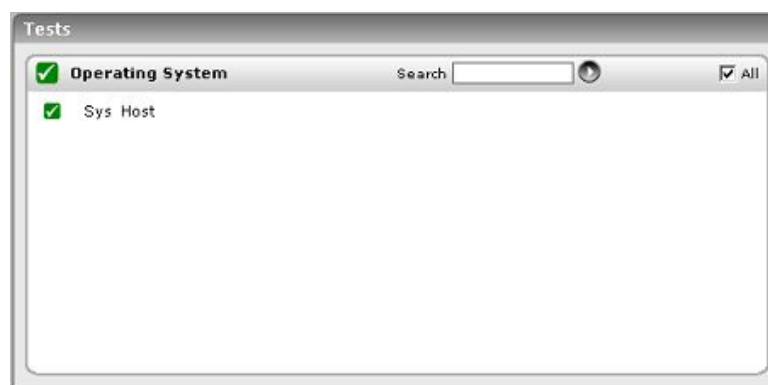
Figure 3.2: The test associated with the Operating System layer

Using the SysHost test mapped to it (see Figure 3.2), this layer monitors the CPU and memory utilization of the Juniper DX device.