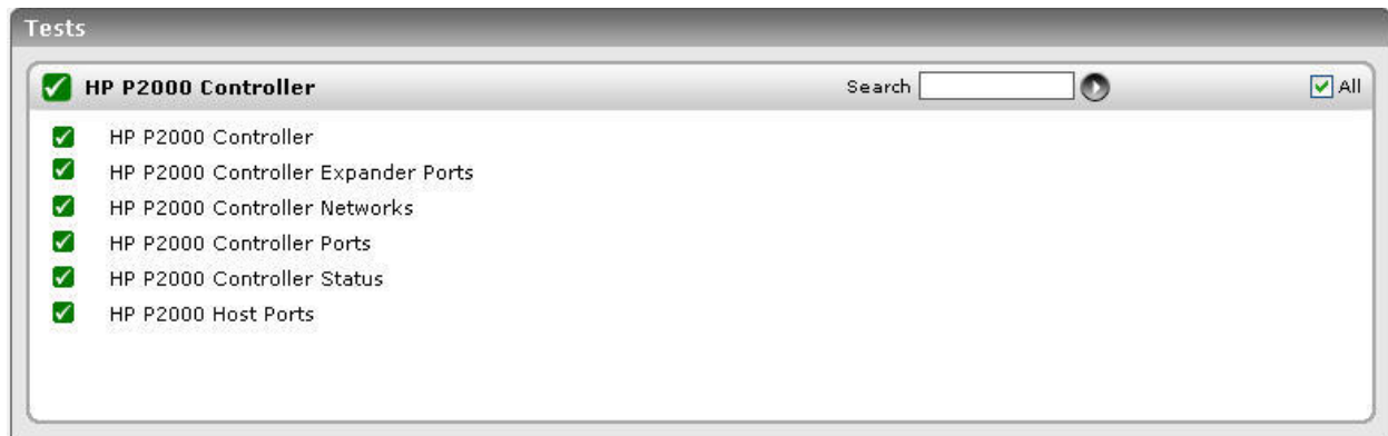
Figure 3.3: The tests mapped to the HP P2000 Controller layer